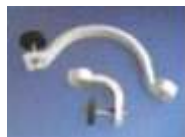
Surgical Bed Adaptors (anterior/posterior) Model #1201-65