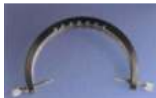
Traction Tongs carbon graphite (titanium lock-nuts/S-hook) Model #1210