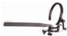
Skate Assembly (includes head spoon) Model #1201-12